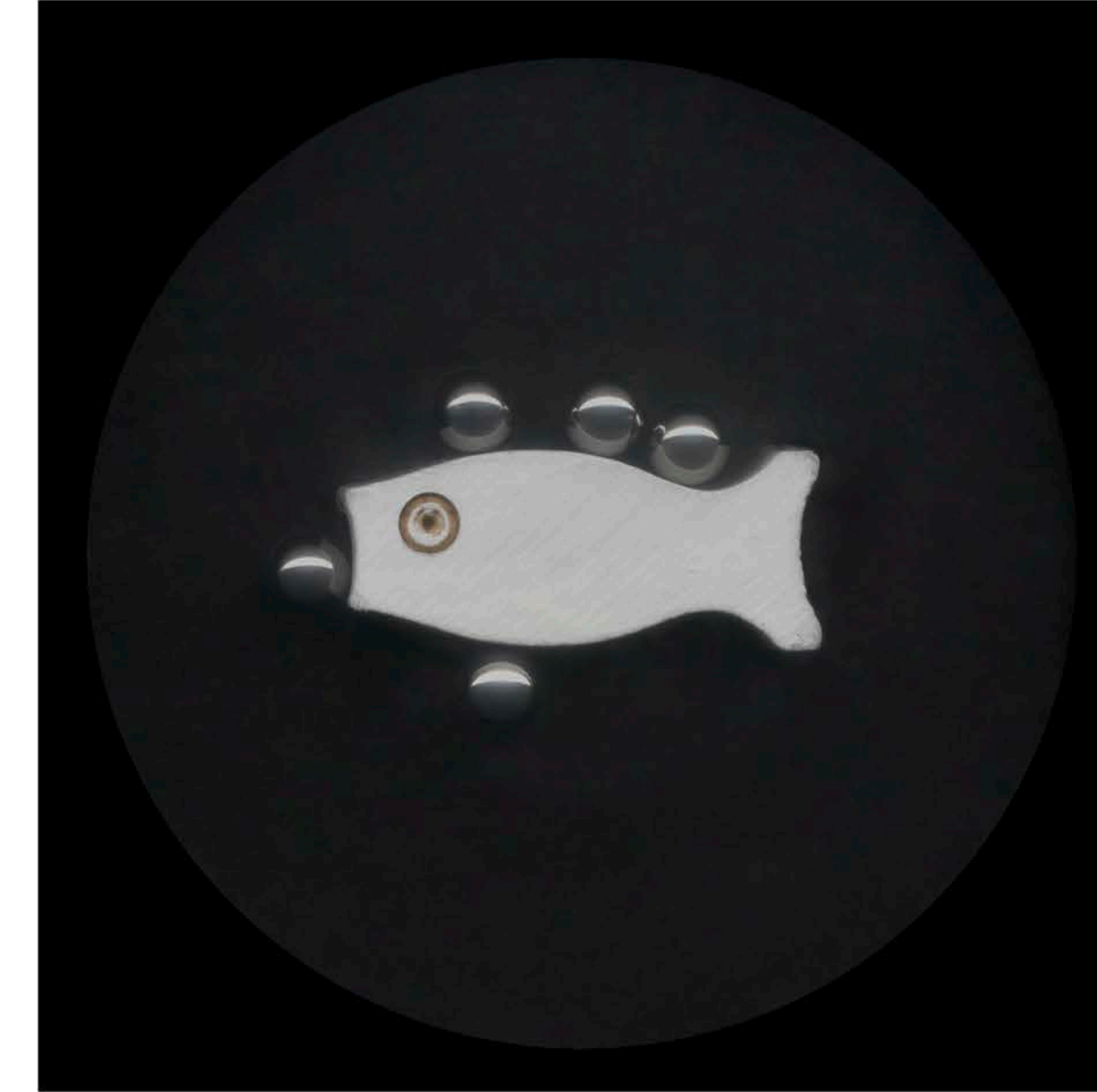
Triptych: 102 x 28 in